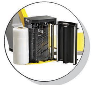
Quick & Easy Film Loading